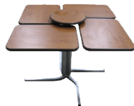
TERC*4 4-station ergonomic, rectangular adjustable table