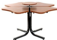
TDC*4 4-station ergonomic, cloverleaf, adjustable table