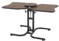
TDR*2 4-station ergonomic, rectangular, adjustable table